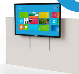
Invisible Motorised Wall Bracket